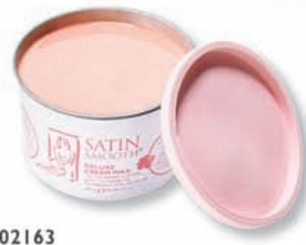
302163 Deluxe Cream Wax Short, stubborn hair Dry dehydrated skin Ultra-rich cream formula