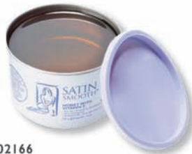
302166 Honey Wax with Vitamin E Gentle formula for all skin and hair types Infused with soothing vitamin E