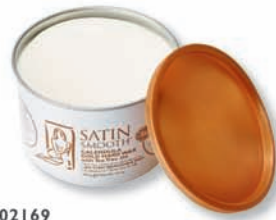
302169 Calendula Gold® Hard Wax Coarse, stubborn hair All skin types With titanium dioxide to protect skin