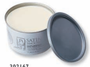
302167 Zinc Oxide Wax Medium hair Blemish-prone skin Built-in UVA sunscreen protection