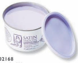
302168 Lavender Wax Medium to coarse hair All skin types Infused with pure lavender oil